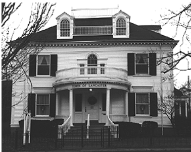
Lancaster, New York HISTORICAL SOCIETY 40 Clark Street Lancaster, NY 14086

You are cordially invited to attend the Annual Meeting and Holiday Open House at 2:00 p.m. on Sunday, December 14.